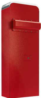
1 LIMIT 800 24V